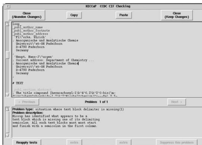
Fig. 5.3.3.9. HICCuP edit window and error description.

at the point where the program has detected the first error and a terse statement of the type of error, with a longer explanation of its nature and possible cause, would be given.